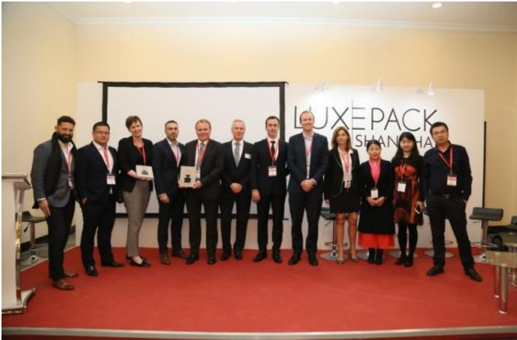
The winners of the LUXE PACK in green Awards with the jury members and organizer Managing director